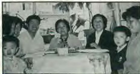
Part of the first house church in Harbin, China. This story was provided by the Hong Kong office of the Eastern Asia Committee.

Members have applied for a permit to build their own church, but permission has not been given. Today more than 1,500 members in Harbin desperately need suitable places to worship.