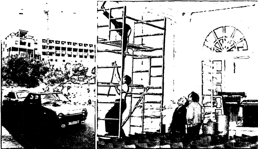
Shown above is the new addition to Sagunto College in Spain, the special project you supported with your Thirteenth Sabbath Special Projects Offering, second quarter, 1982.

Shown above are the projects you helped make possible, second quarter, 1982, when the Special Projects portion of your mission giving amounted to $302,425.04. Shown at left is the girls' dormitory in Sagunto, Spain; at right, the French chapel, part of the reconstructed evangelistic center in Brussels, Belgium. This could not have been undertaken without your help. The special projects for this quarter