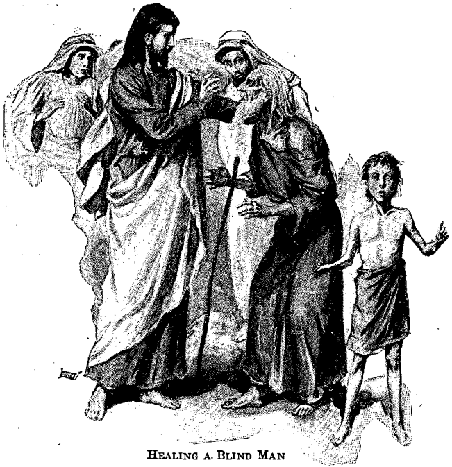
HEALING A BLIND MAN

NOTE.—“Put out of the synagogue.” Edersheim states that among the Jews there were three kinds of “excommunication.” The first and lightest was a rebuke. Ordinarily the period of disapproval lasted for seven days, but if pronounced by the head of the Sanhedrin, it continued for thirty days. The second degree of excommunication lasted for thirty days; and at the end of that term, “a second admonition” was given, which extended the time thirty days longer. This could be pronounced only in an assembly of ten, and was accompanied by curses, and sometimes proclaimed with a blast of the horn. The final excommunication placed a ban of indefinite duration on a man. “Henceforth he was like one dead. He was not allowed to study with others, no intercourse was to be held with him, he was not even to be shown the road. He might, indeed, buy the necessaries of life, but it was forbidden to eat or drink with such an one.”