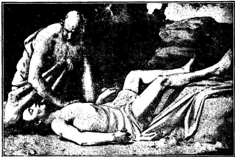
THE SAMARITAN HAD COMPASSION ON HIM.

belonged mostly to the sect of the Pharisees, and fell under the reproof of our Saviour for having taken from the people the key of knowledge.”— Bible Dictionary . See Luke 11:52.