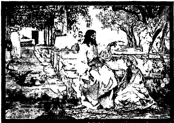
MARY SAT AT JESUS' FEET.

NOTE.—“The Saviour had no home of His own; He was dependent on the hospitality of His friends and disciples; and often, when weary, thirsting for human fellowship, He had been glad to escape to this peaceful household, away from the suspicion and jealousy of the angry Pharisees. Here He found a sincere welcome, and pure, holy friendship. Here He could speak with simplicity and perfect freedom, knowing that His words would be understood and treasured. Our Saviour appreciated a quiet home and interested listeners. He longed for human tenderness, courtesy, and affection.”— “The Desire of Ages,” p. 524.