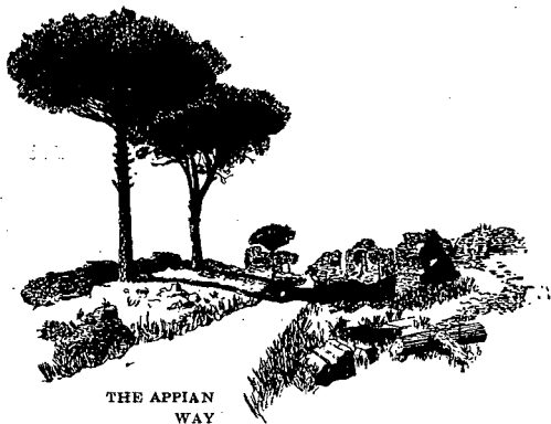
THE APPIAN WAY