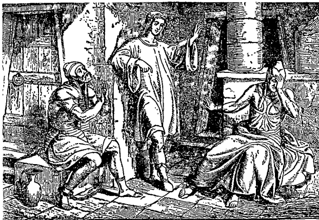
Joseph in prison