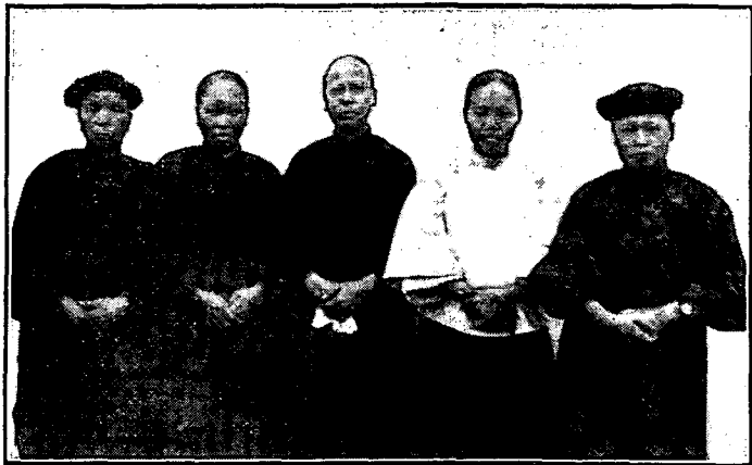
Women from the Hakka language area, southeast of Kweiyang, who are all members of the Seventh-day Adventist Church