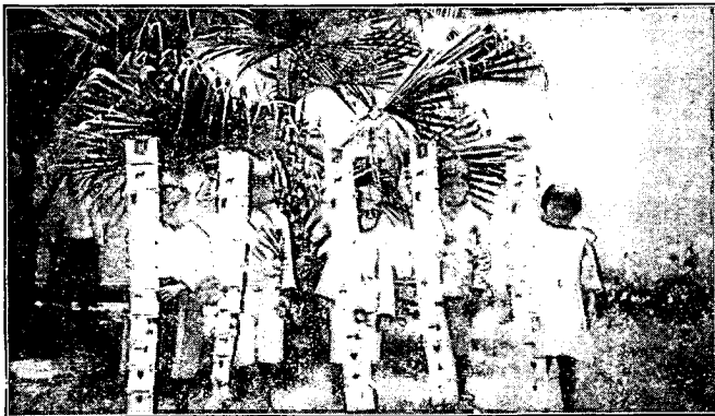
A Sabbath school class at the Lima, Peru, Training School, holding up their Memory Verse Cards. The cards were made by the teachers.

Thirty-two pages monthly for him who teaches, leads, or loves the Sabbath school. Price, 90 cents a year, single subscription; two or more copies to one address, each 75 cents a year.