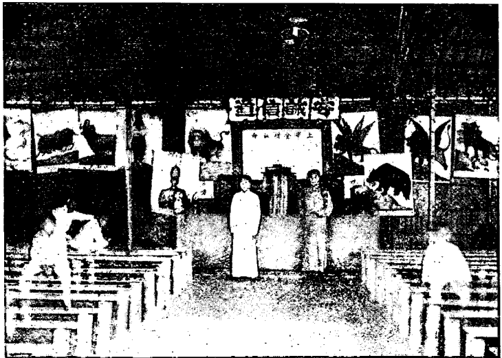
INTERIOR OF BAMBOO GOSPEL TENT NEAR SHANGHAI