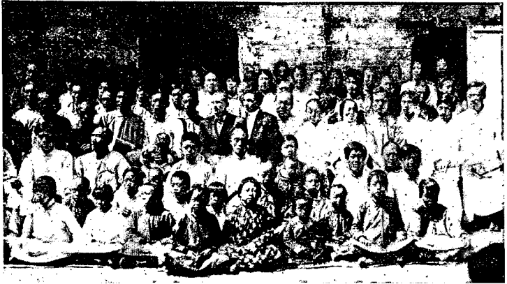
BELIEVERS AT GENERAL MEETING IN ANHUEI